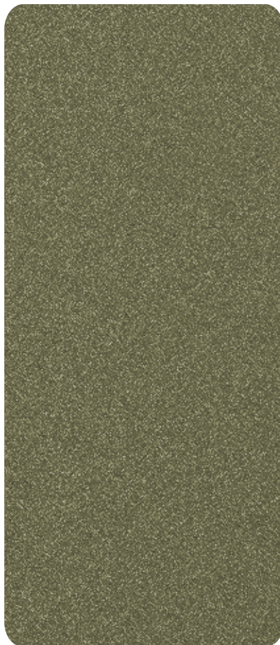
MT - 5007 - slate