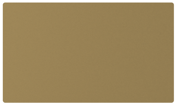
MT - 5010 - toledo