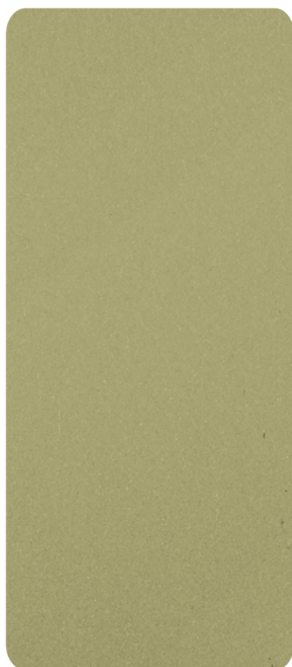
MT - 5004 - silk grey