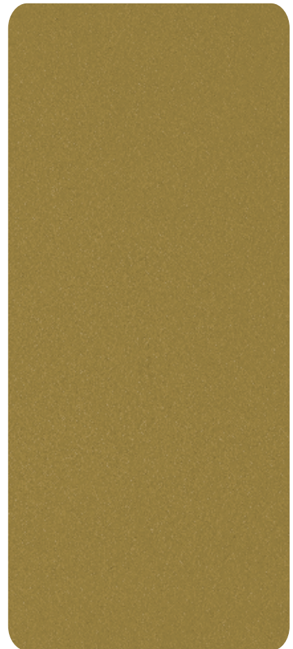
MT - 5003 - beige