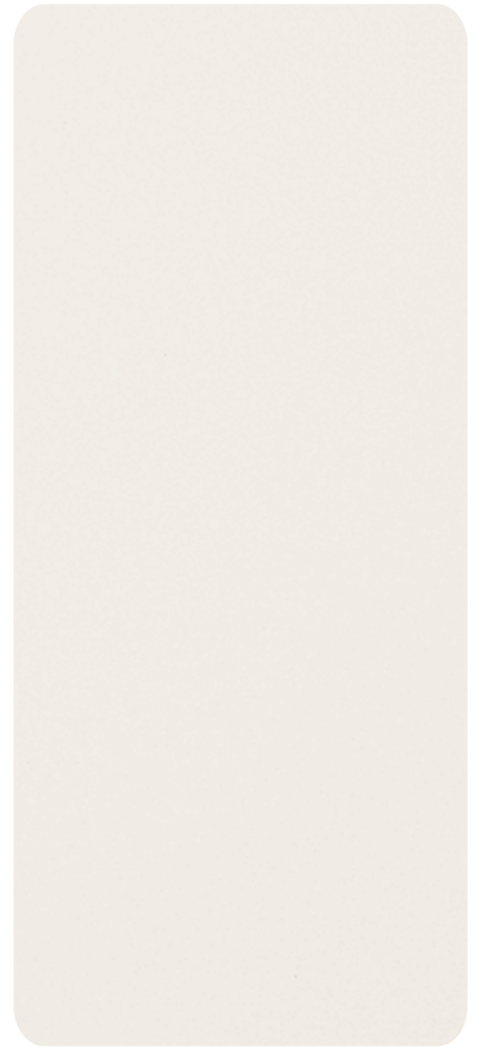
MT - 5001 - white