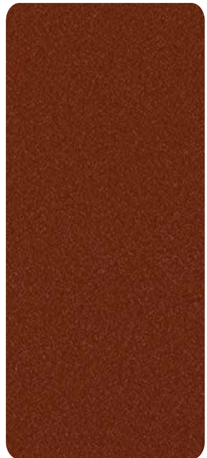
MT - 5006 - brick