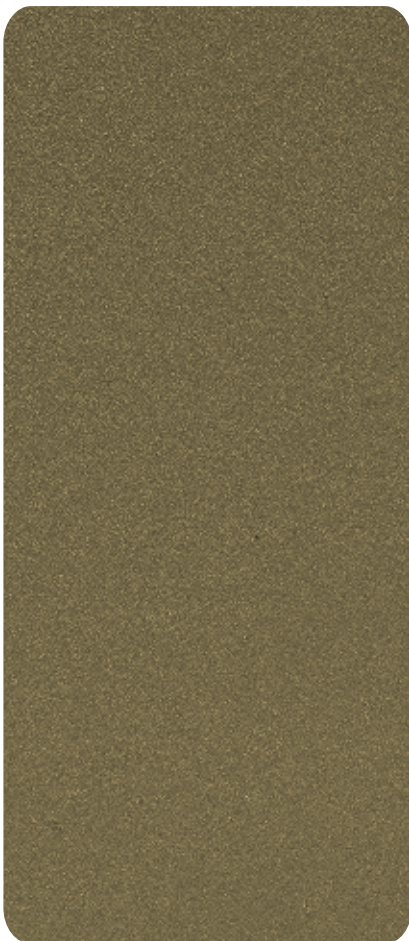
MT - 5005 - olive grey