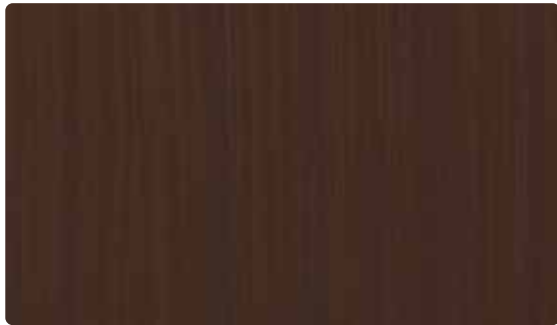
TI - 12 - cherry cherry