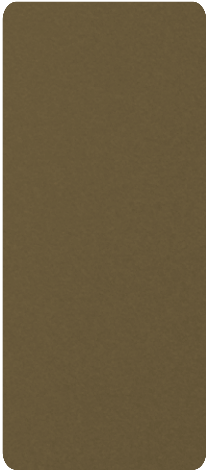
MT - 5009 - cement