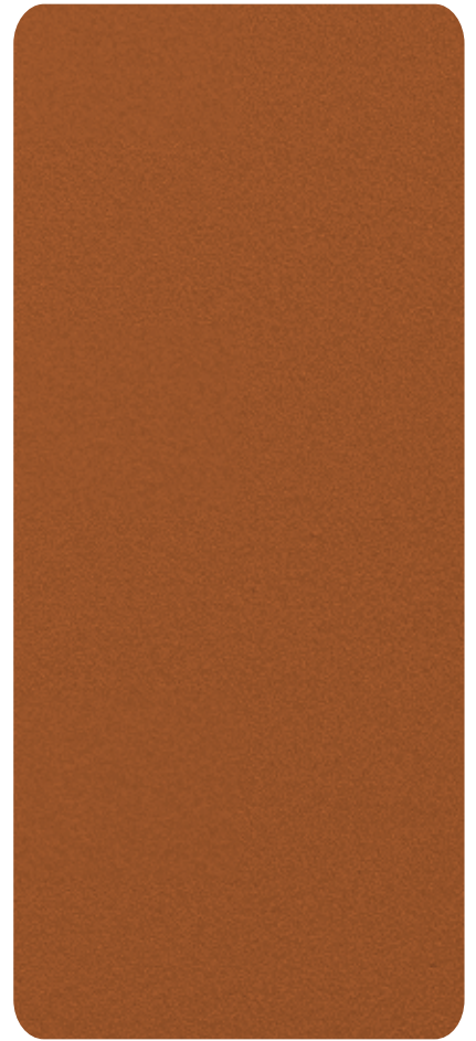
MT - 5014 - dholpur