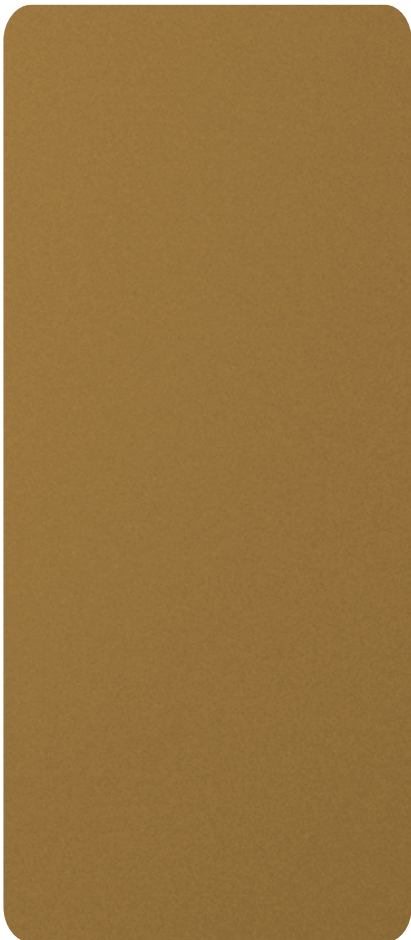
MT - 5012 - thorn