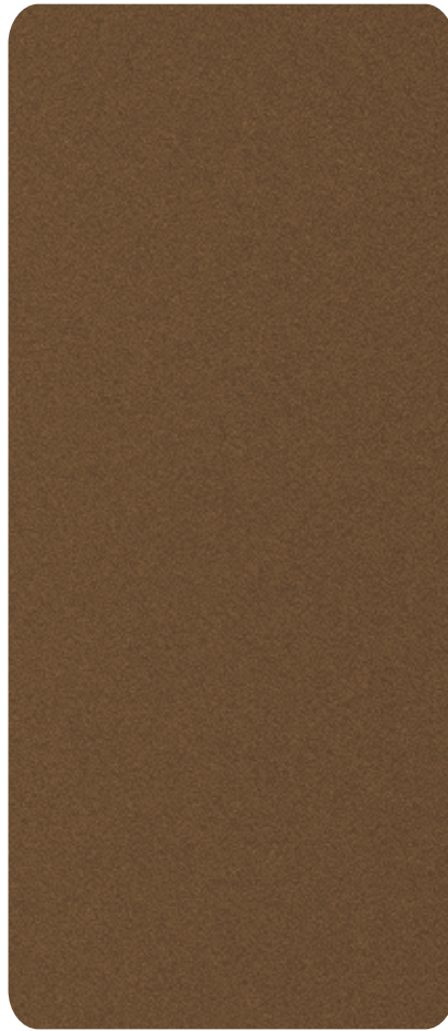
MT - 5011 - moka