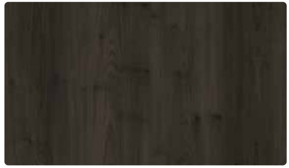
TI - 18 - dove maple